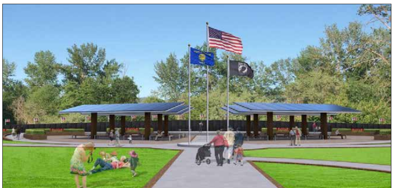
Artist's rendering of Vietnam Memorial Wall

Circulation Department, VFW Magazine, Broadway at 34th St., Kansas City, MO 64111.